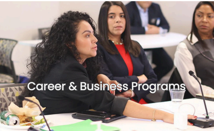
Career & Business Programs

2024 was a great year for the American Latino Veterans Association (ALVA) and those we serve! We grew our membership by 106%, secured new sponsors and partners, held a successful expo and two great ALVA Awards. We grew our voice in the media and in advocacy. We will build off these successes in 2025 and beyond and ask you to join us on our journey to support Latino veterans.