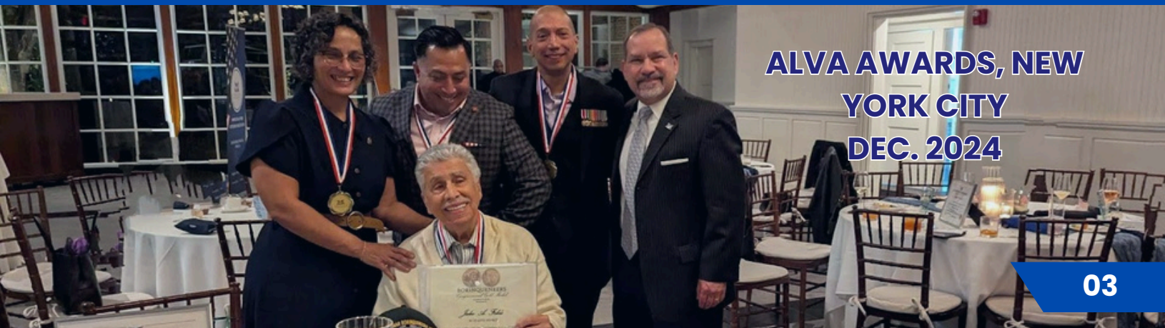
ALVA AWARDS, NEW YORK CITY DEC. 2024