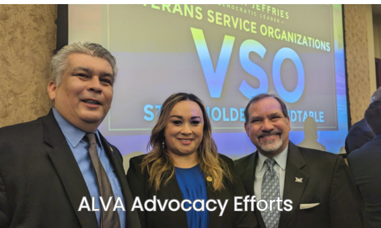
ALVA Advocacy Efforts