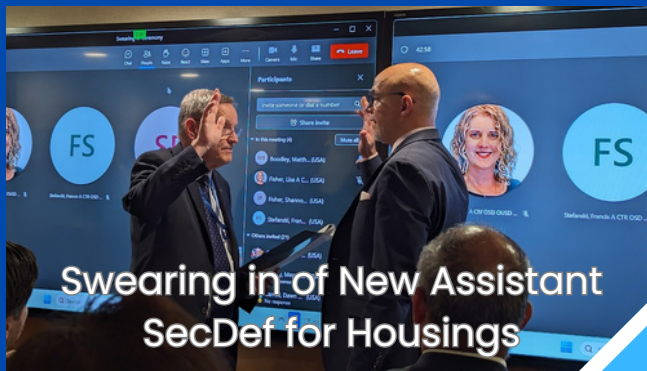
Swearing in of New Assistant SecDef for Housings

To help Latino veterans thrive and recognize their indispensable contributions.