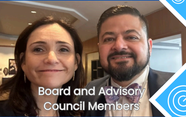
Board and Advisory Council Members