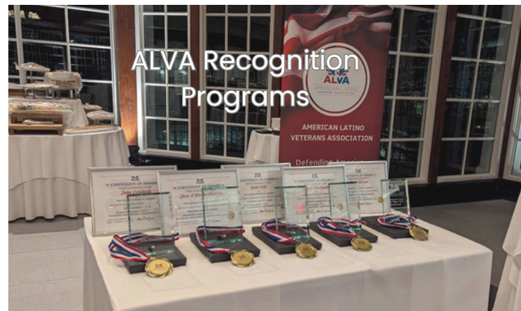
ALVA Recognition Programs