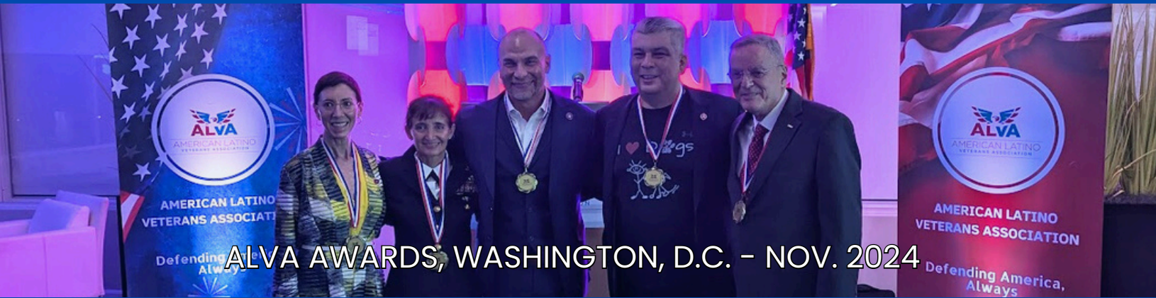
ALVA AWARDS, WASHINGTON, D.C. - NOV. 2024