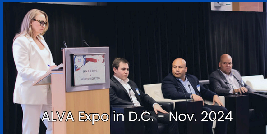
ALVA Expo in D.C. - Nov. 2024

Conducted Latino Veteran Entrepreneur survey in partnership with Prosperity Now